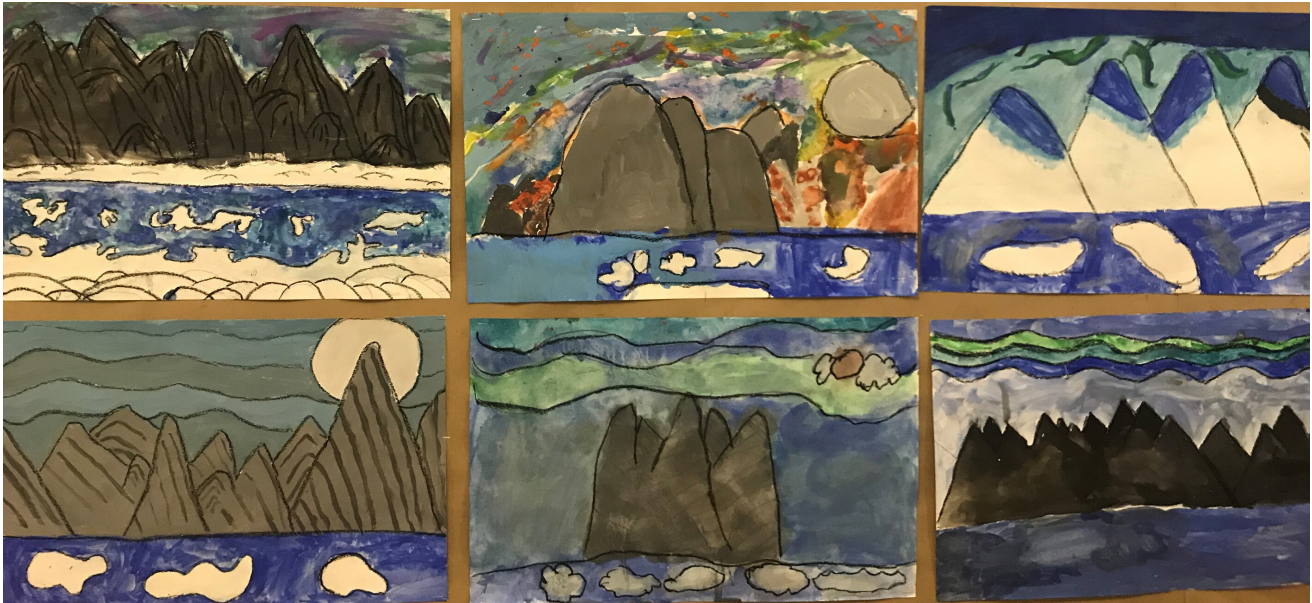
Artwork displayed outside the main office